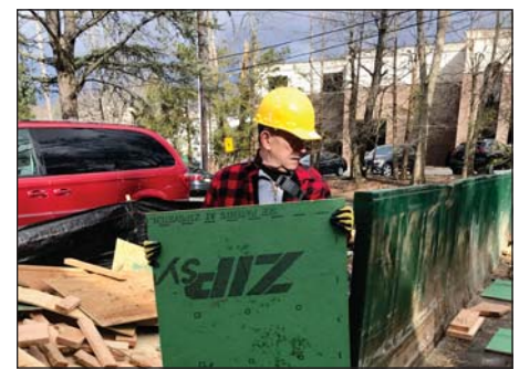
Clockwise from top right: House at 11 Grand Terrace as of March 14, 2019, on-site cleanup, volunteers from GAP Stores.