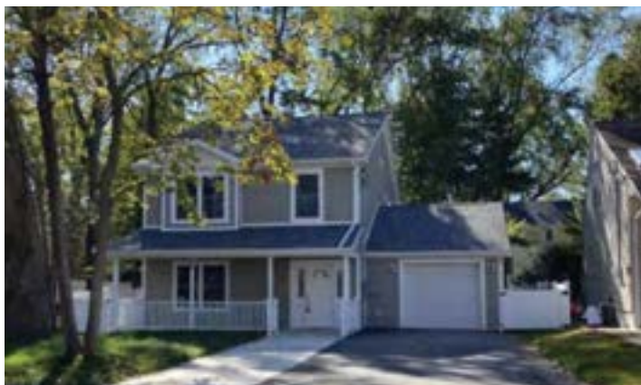
2020 - 11 Grand Terrace, Livingston, NJ. Single Family home 3BR/3BA