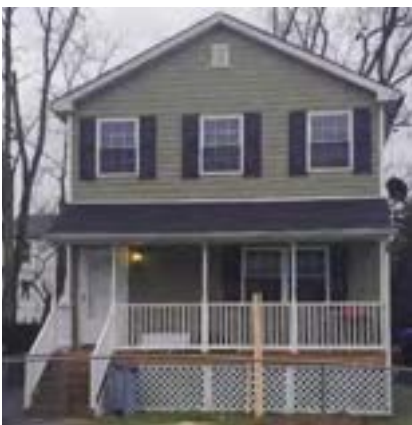
2019 - 2112 Whittlesey Avenue, West Orange. 2-family with 2BA 1BA