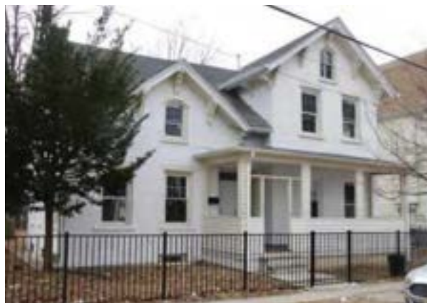
2018 - 103 Elm Street, Orange, NJ. Single Family home with 3BDR/2.5BTH