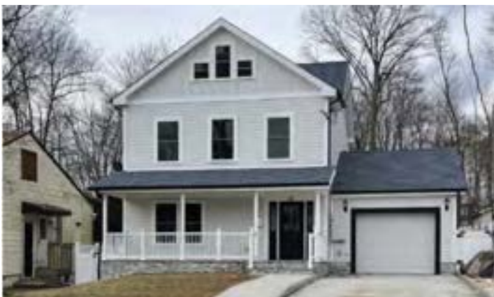
2022 - 24 Burnet Street, Livingston, NJ. Single Family home 3BR/3BA. This home's construction was funded by J.M. Huber Corporation.

Having completed Phase I we are poised to begin Phase II at this critical juncture when the barriers to home ownership for low to moderate-income residents are so extensive. As we are preparing to launch this project, Habitat Greater Newark is seeking new private partners to financially support the project. Once completed, Phase II will provide 6 more units of homeownership. Our projects provide homeownership to families earning under 80% of the Area Median Income, and historically the population serves 85% Black and 15% Latino. . No other project in the region can provide homeownership to working families at this income level.