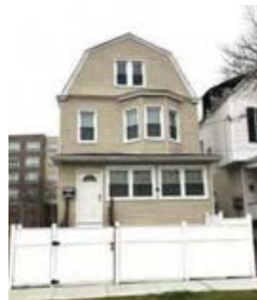
2018 - 203 Hickory Street, Orange, NJ. Single Family home with 4BDR/2BTH